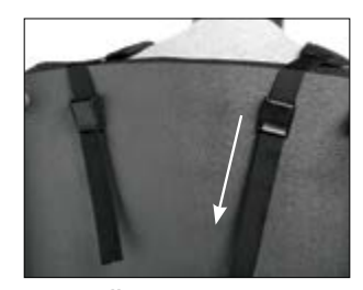
Rear-pull option When cam buckles are preferred for frequent length adjustment, the side release buckles can be removed from the top straps for this simple conversion.