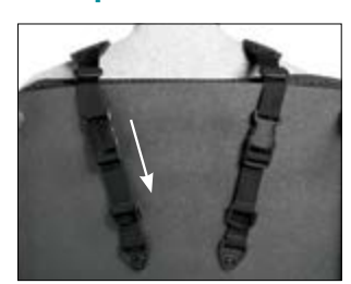
Rear-pull attachment The rear-pull attachment enables caregivers to adjust the harness from behind and keeps the buckle away from the user. It's also ideal for thicker backrests.